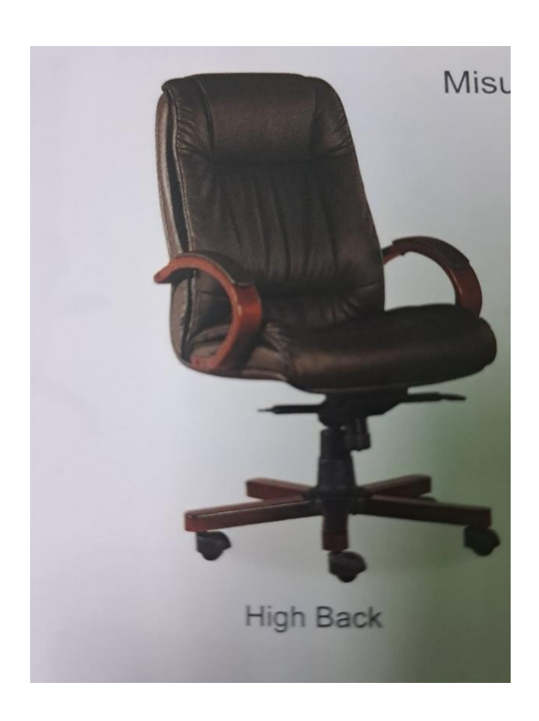
4 x visitor's chairs black leather with Mahogany finish

1 x High Back black leather with Mahogany finish