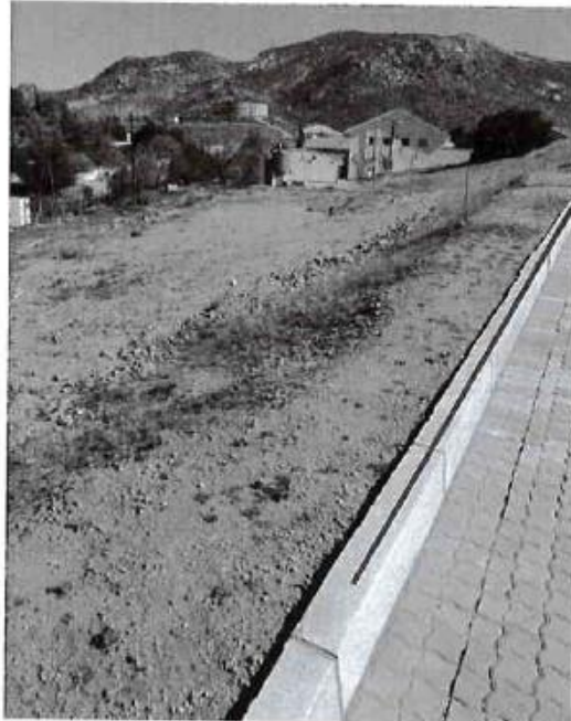
Access point from upper road