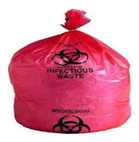
Figure 1: 80 Micron Red Plastic Bags

The supplier shall provide impermeable, tightly sealed containers or 80-micron red plastic bags together with a securing mechanism (e.g. cable ties) large enough to contain all the garments to be laundered. There should be sufficient containers or plastic bags, clearly marked with a biohazard label as depicted in picture below (Figure 1), as required by the Regulations for Hazardous Biological Agents and will be delivered to the facility for their use with each delivery.